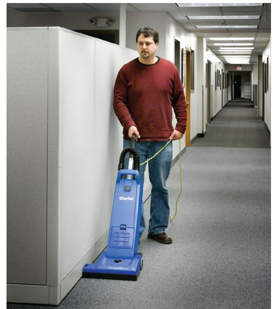
Light handle weight won't fatigue the operator.

Unlike most dual-motor vacuums, the CarpetMaster has its vacuum motor located at the base of the machine. The result is a lighter handle weight. That means less fatigue for the operator.