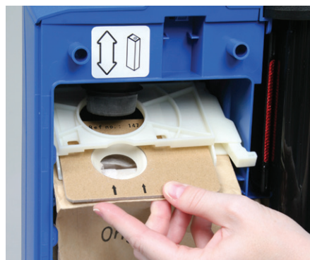
Quick and simple bag replacement. Just lower the bag holder and pull your used bag out, then slide in a new bag and snap holder back into place. Easy as 1-2-3!