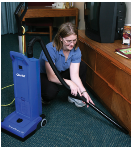
Easy to use quick-draw detailing wand and tools.