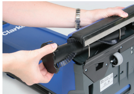
Easy to change brush. Simply unlock the brush and pull out.