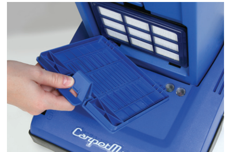
Convenient access to standard H.E.P.A. filter.