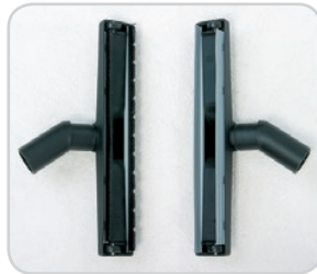
14 inch hard floor and squeegee tools.