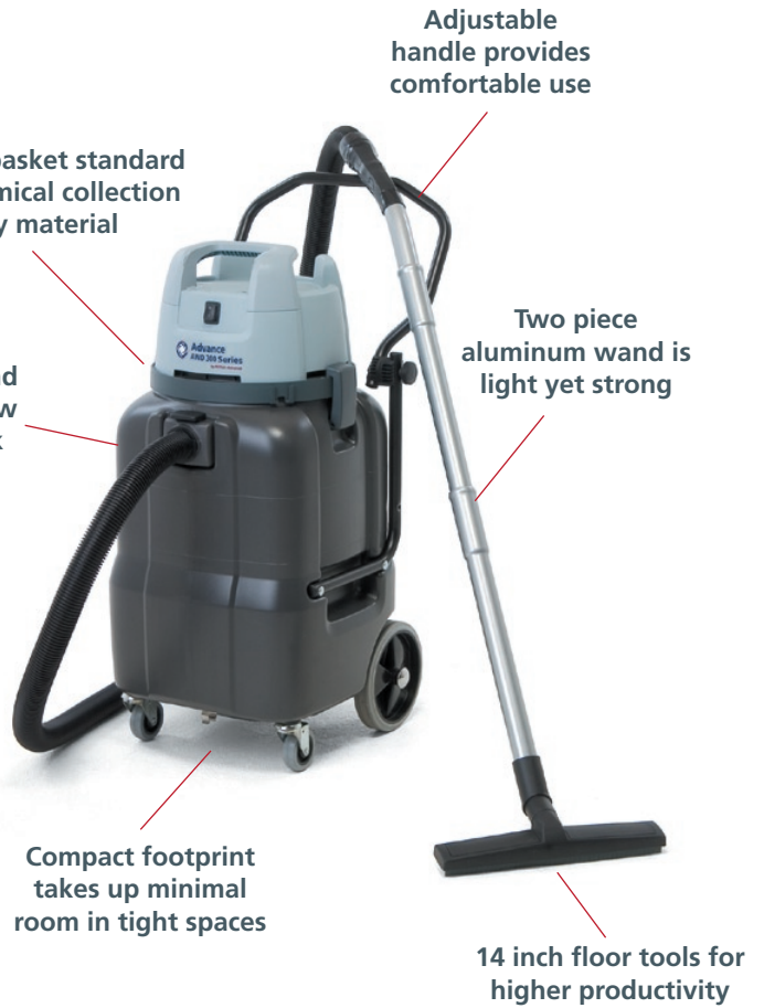
Dry filter basket standard for economical collection of dry material