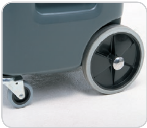
Gray non-marking wheels.