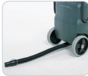
Rear drain hose makes emptying a breeze.